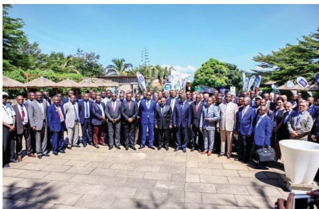
Family photo of participants around the pool of the Hotel Club Lake Tanganyika on June 14 th , 2018.