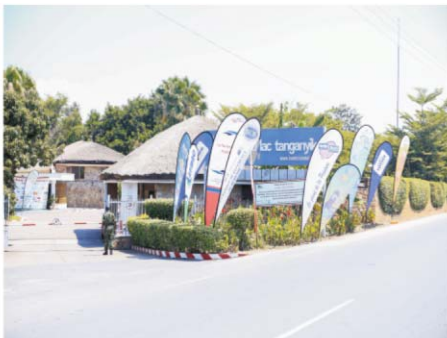
Outside of the place that hosted Industrial Fair