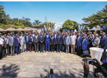
Family picture of the participants