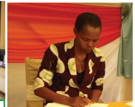
Signature in the AIB's guestbook