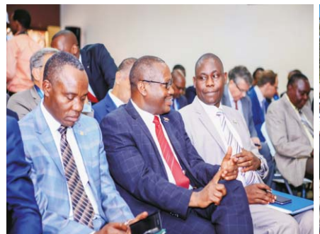
Partial view of Officials