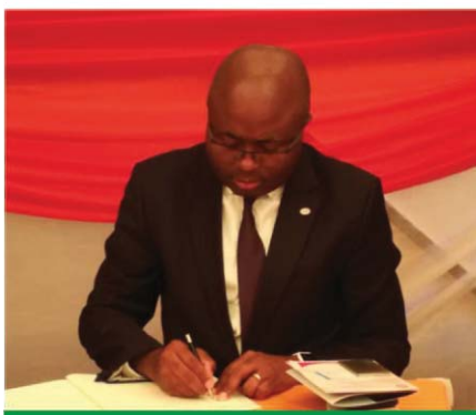
Signature in the AIB's guestbook