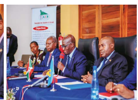
Speech of the Minister of Commerce