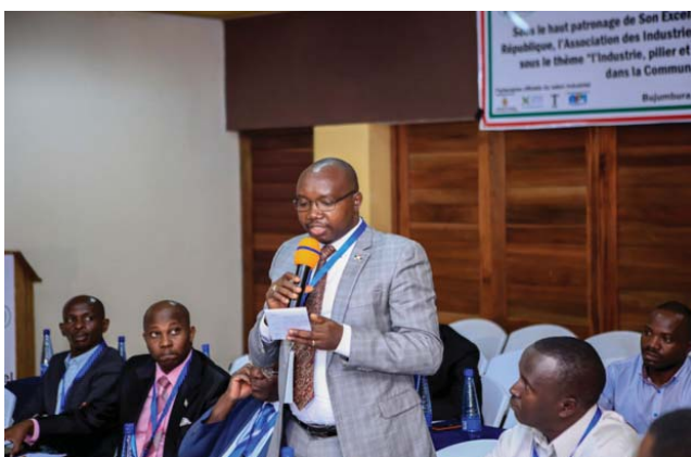
Statement by the Director of the Investment Promotion Agency standing up during his speech on June 15, 2018

A break of sixty minutes was observed for the Lunch.