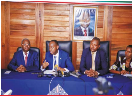
Interviews with the press