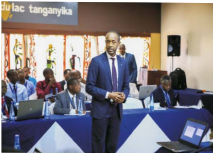
Panelist presenting a theme