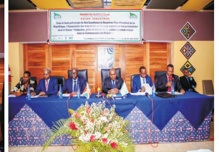
Welcome remarks of the Mayor of the city of Bujumbura