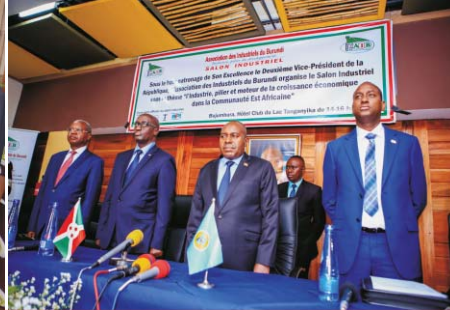
Honor to the national anthem