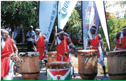
Cultural animation group