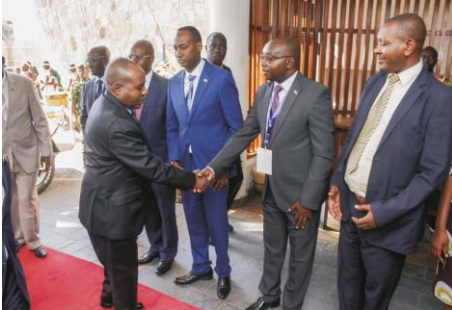
Arrival of the 2 nd Vice-President of the Republic Burundi