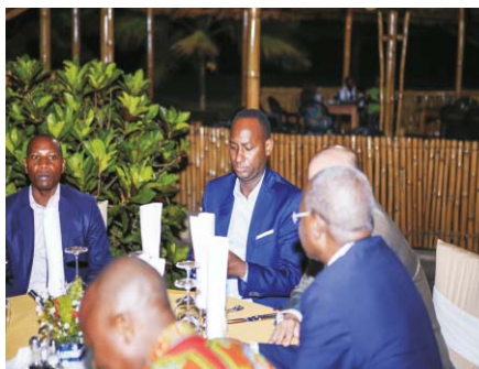
The President of AIB with his guests during the business diner