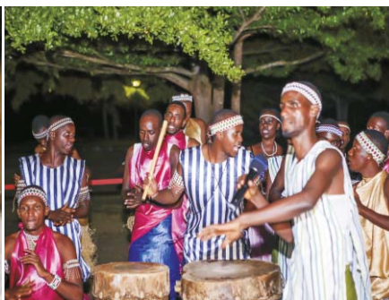
Cultural animation group