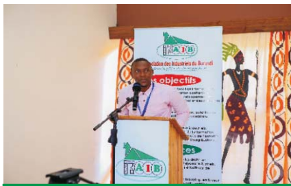
Master of ceremonies at the 3 rd day of Industrial Fair