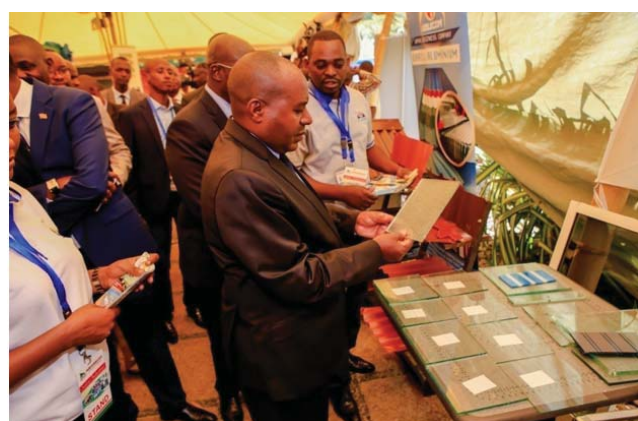
Visit of the Stands by His Excellency the Second Vice President of the Republic of Burundi (in the forefront).