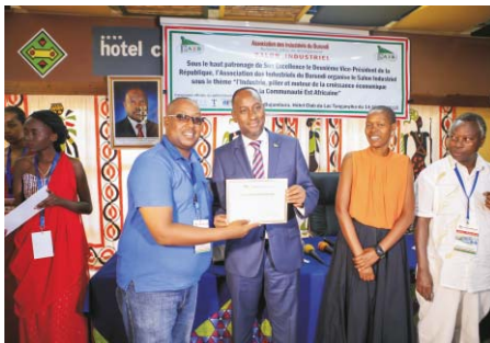
Delivery of certificates to participants in Industrial Fair