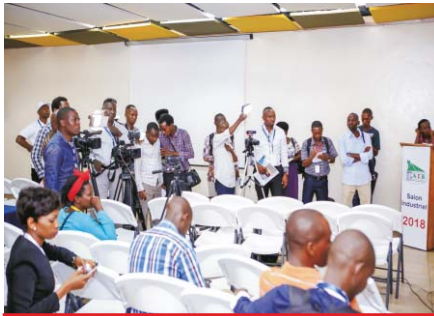
Interviews with the press