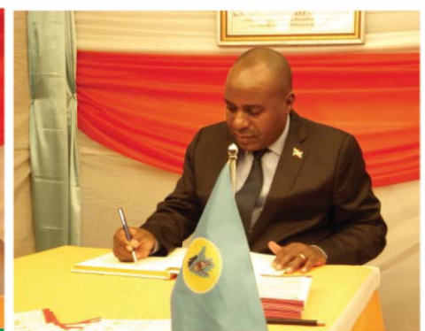
Signature in the AIB's guestbook