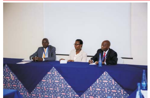
Panelists answering questions from participants