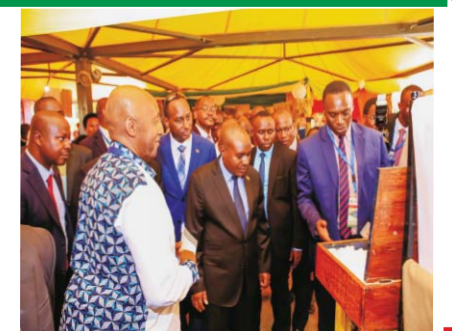
Visit of the stands