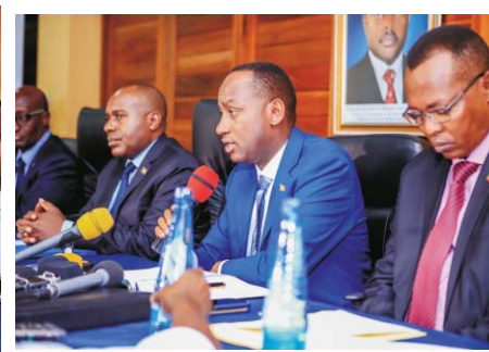
Speech of the President of AIB