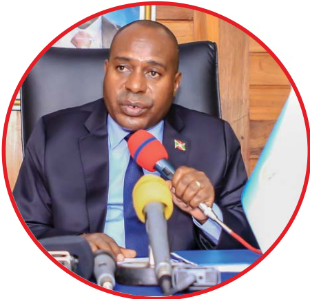
Joseph BUTORE THE SECOND VICE PRESIDENT OF THE REPUBLIC OF BURUNDI

".....The Industrial Fair, one of whose main missions is to promote the industrial sector of the sub-region in general and Burundi in particular, is the result of the combined efforts of the Association of Industrialists of Burundi (AIB), the Ministry of Trade, Industry and Tourism, Trade Mark East Africa, CFCIB/FCCIB and the Investment Promotion Agency (API/IPA).... "