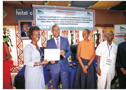
Delivery of certificates to participants in Industrial Fair