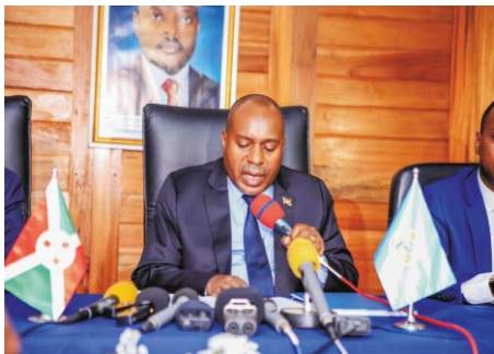
Speech of the 2 nd Vice-President of the Republic Burundi