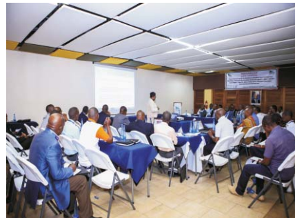
Panelist presenting a theme