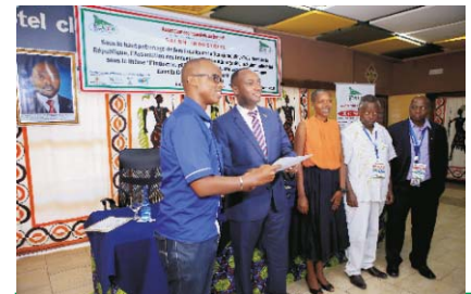
Delivery of certificates to participants in Industrial Fair