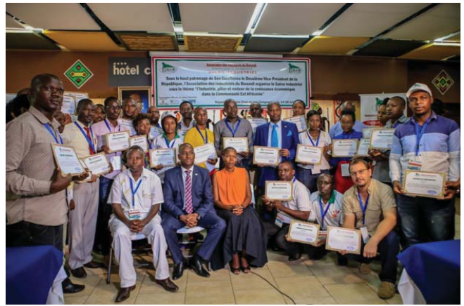
Family photo after the presentation of the certificates of honor to the companies participating in the first edition of the 2018 Industrial Fair

The AIB President invited all the laureates to take a photo and that is how the first Edition of the Industrial Fair ended with an acclamation.