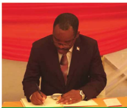
Signature in the AIB's guestbook