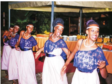
Cultural animation group