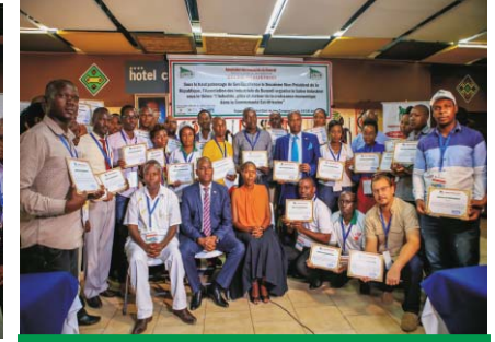
Family picture of participants with the certificates of participation