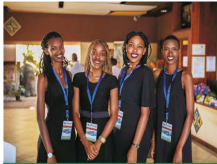
Hostesses responsible for the registration of the participants